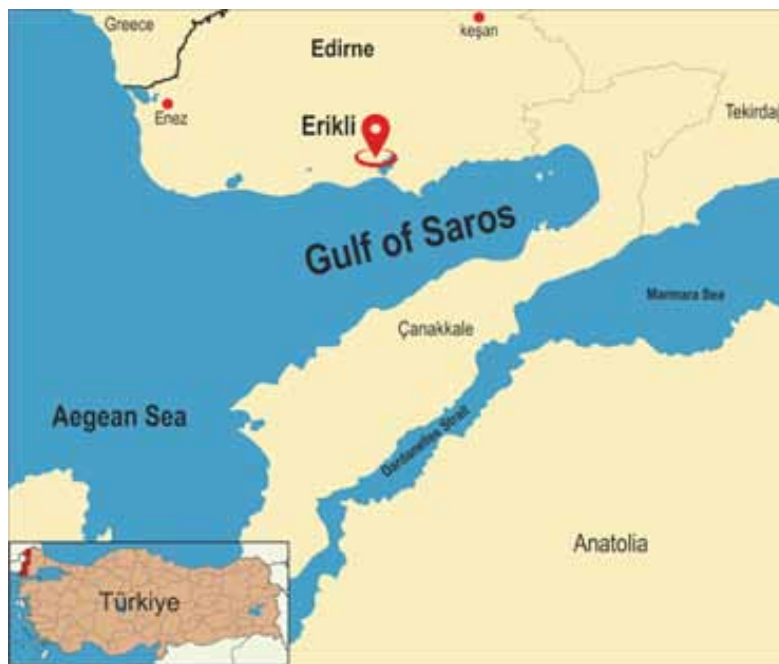
Figure 1. Location of Erikli coastal settlement (Google Maps, 2022).

Erikli coastal settlement: It is located 140 km from Edirne city center and 30 km from Kesan's city center. The Erikli settlement is located southwest of Kesan, on the shore of the Aegean Sea, the Gulf of Saros, on the Mecidiye-Erekli coastal road 22.55. The length of the coast is about 3 km. The population of the settlement is seen as 496 in 2022 (Çekmez, 2009); (Figure 1).