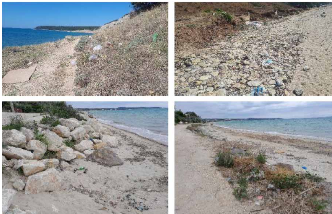
Figure 5. Wastes left in the area by visitors (Alali, 2024).