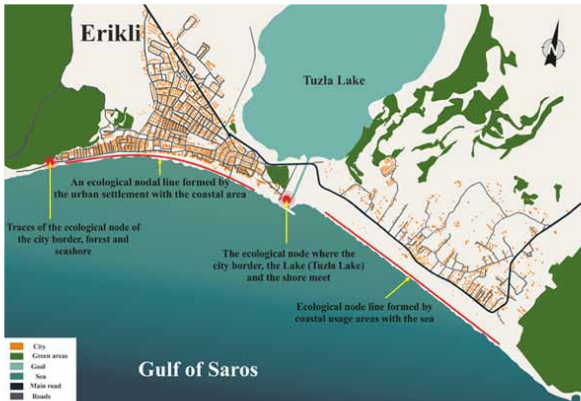
Figure 2. Node points of ecological traces of Erikli coastal settlement (www.ilcelerikoyleri.com; improved by Alali).

Erikli, the most important coastal settlement of the Gulf of Saros, is seen to have traces of ecological node points in the formation of natural potentials (Figure 2).