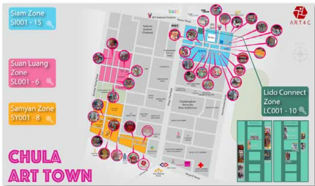
Figure 1. Chula Art Town’s 4 zone map.

In google lingo there are five “Stories” or sections with the first titled Chula Art Town, A Public Art Space for the Community followed by 4 “zones” or neighborhood art clusters going by local names: Siam, Lido Connect, Suang Luang and Samyan.