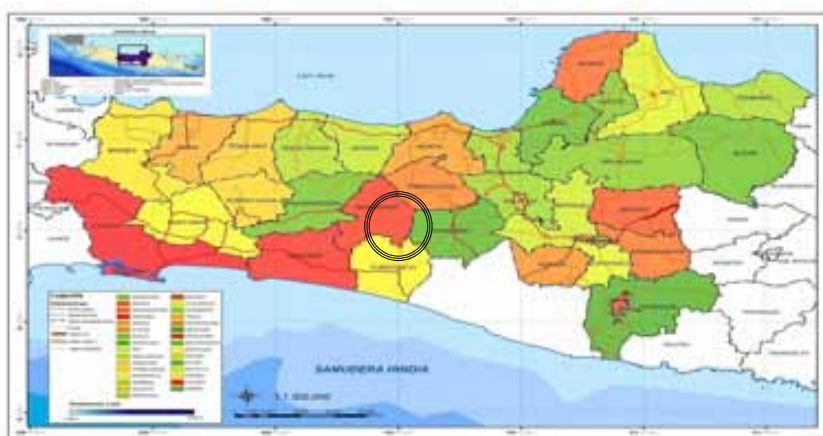
Figure 4. The Location of Parakan within the Island of Java. Source: genericcheapmed08.com, has been accessed on 7th February 2018.