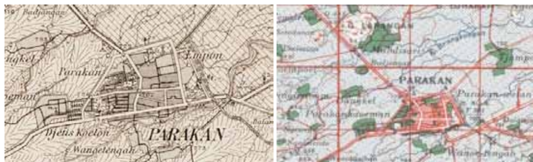
Figure 6. The Map of Parakan from colonial era to post-colonial era.