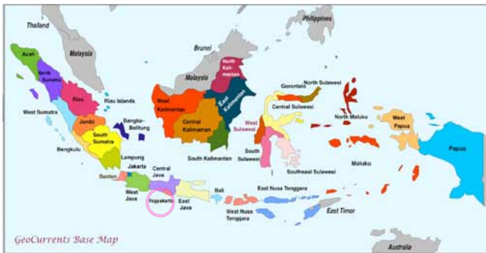
Figure 3. Map of the provinces of Indonesia showing the location of Parakan.

The designation of an area as historical is one that should be made by the local or central government. Indonesia, as a country with many islands and many historical areas, needs to make more effort towards preservation and conservation. One area which has many historical buildings and a significant character of its own is the city of Parakan. It is in the district in Temanggung and is a relatively unknown city as not all Indonesians know about it (see Figures 2, 3 and 4). However, in 2015 it was designated as a heritage city and since this classification many people have been eager to learn about its history and to explore it directly.