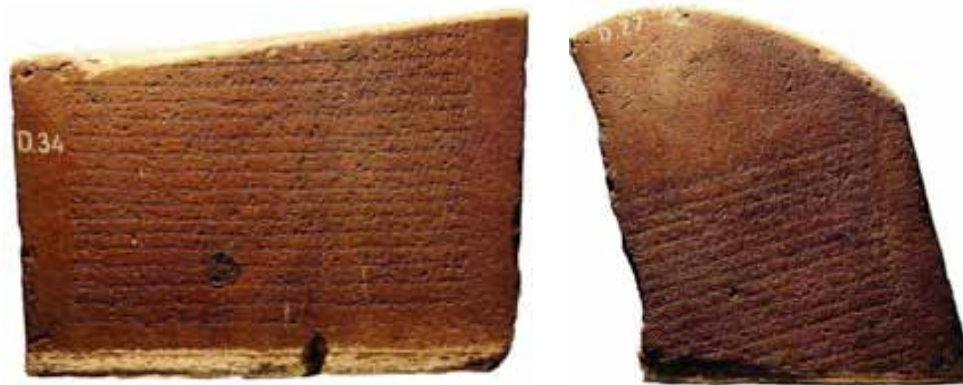
Figure 1. The Prasasti of Kayumwungan, there are only two pieces out of 5 remaining, D34 and D27. This Prasasti of Kayumwungan has been known as Prasasti of Karang Tengah as it was found in the Karang Tengah Village that today is known as Parakan.

Evidence for the existence of Parakan, which had been known as the Karang Tengah Village, is the existence of an inscribed stone named Prasasti Kayumwungan. Its inscription describes the history of the area in ancient Javanese and Sanskrit languages. This stone was found one hundred years ago in the Karang Tengah Village area and is proof of the existence of Parakan, which had been an area for all the rakai during the Mataram Kuno Hindu era. The Prasasti of Kayumwungan should consist of five pieces of stones with ancient Javanese inscriptions, but only two pieces remain (D27 and D34) (see Figure 1). This prasasti, also known as Prasasti Karang Tengah, can be found in the National Museum of Indonesia (Museum Nasional or Museum Gajah).