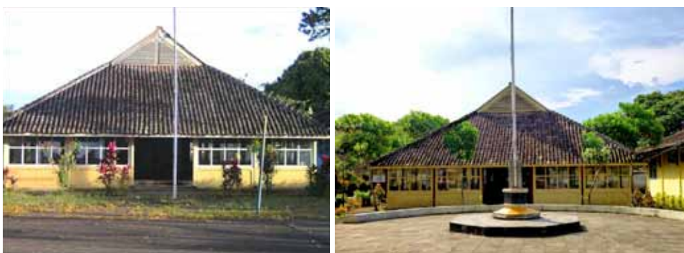
Figure 10. Kawedanan office as one of historical buildings from the colonial era, Left-hand Side: Kawedanan Office in colonial era, Right-hand Side: Kawedanan Office in post-colonial era.

ing was an office for Wedana (the local government in the colonial era, when the country was subject to Dutch policies and regulations). The condition of the building remains the same, but is now unfortunately empty. For some special events, it is used as a hall or exhibition space and sometimes is a meeting place for NPL (Nata Parakan Luwes, a local Parakan community group). It is a classic style building, with a traditional Javanese roof (see Figure 10).