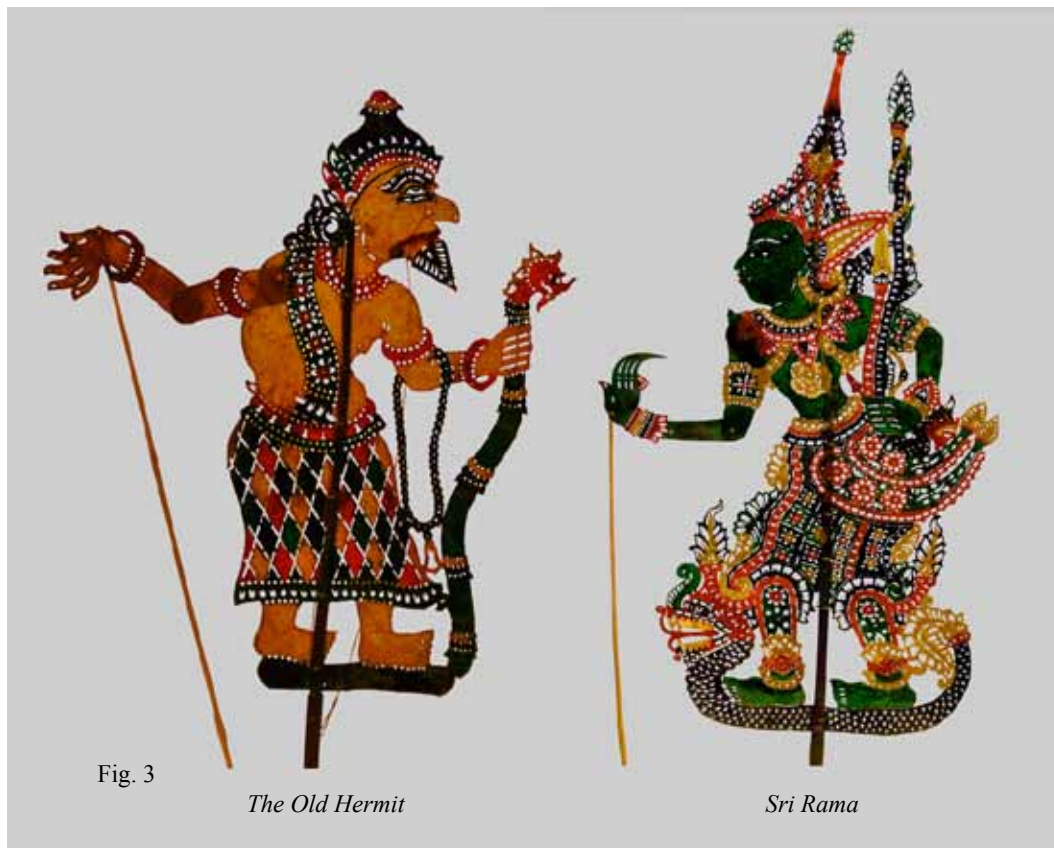
Figure 3. King Rama and the old hermit.