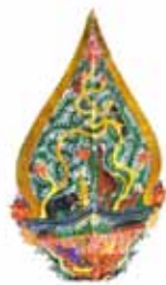
Figure 5. Pokok Beringin – It is used to begin and end the shadow theater performance.

Like all other performative expressions, the theater builds upon the individual's ability to envision or imagine a phenomenon. Active, creative individuals and artists manifest this unseen reality through the theater. As explained above, the Shadow Theater's imaginative reality consists of a mixture of animistic, Hindu and Buddhist as well as Islamic elements. This is not a theater that reflects reality, as it is, but rather a theater manifesting an alternate reality. This liminality where the artist moves betwixt and between reflects a common imagination on both sides of the border. 7 Thus it makes sense to think that this shared cultural imagination and practices could be of vital importance if put into use and made known in the conflicting areas. That might just be a contribution to a beginning to an end of the long lasting conflict in South Thailand?